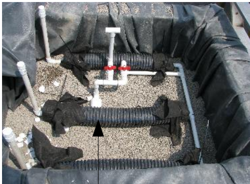
Winter time flood manifolds