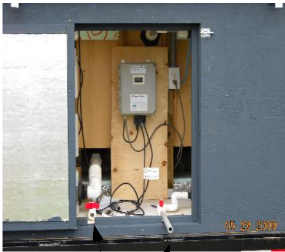
AWS Sample ports